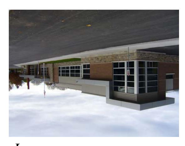
St. Joseph Catholic Elementary School, Grimsby